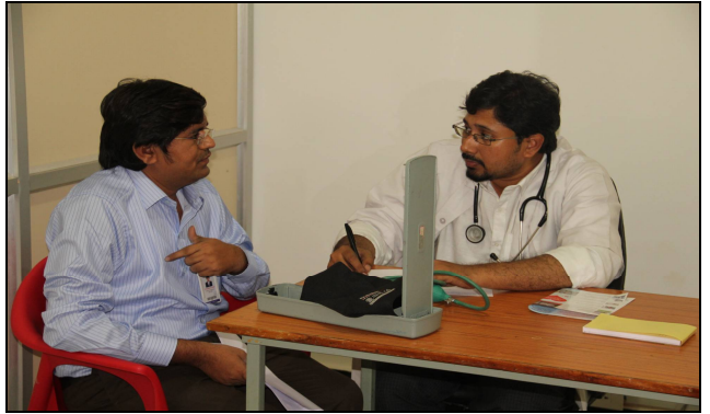
Doctor's team inspecting the patients