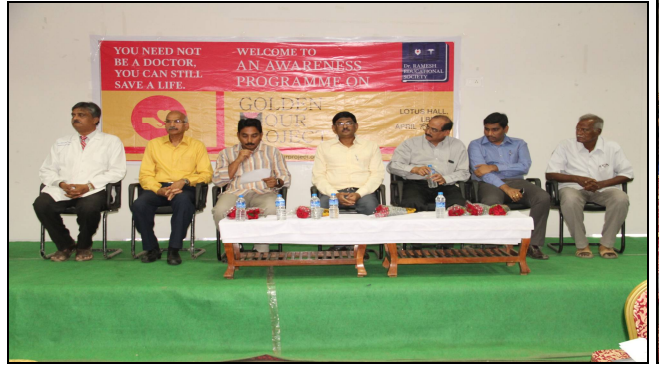
Dignitaries on the dais