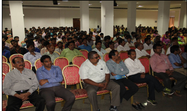
Attandees of the Golden Hour Program