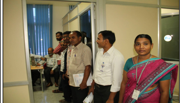
Waiting list of the patients